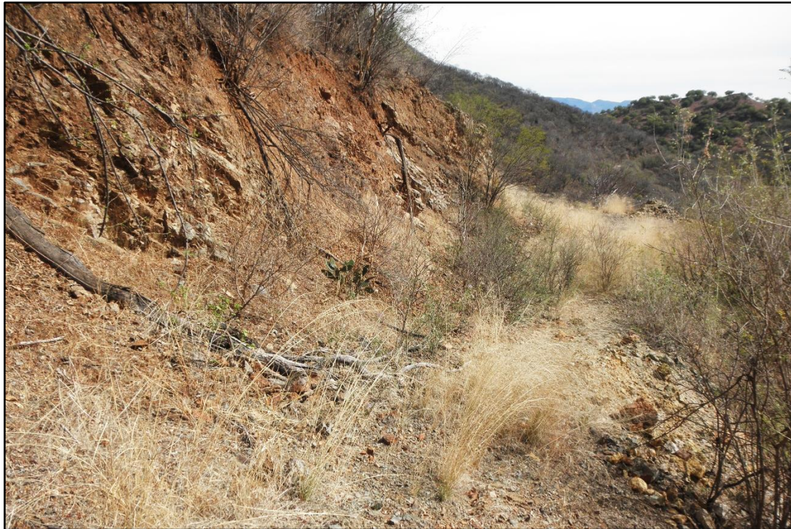
Figure 2. Steep outcrop exposure cut along historical trail on Diamante 1 near La Prieta artisanal mine.

The Eagle Mapping team mobilized from Mexico City with a local flight base from Ciudad Obregón, southern Sonora, Mexico. Our LiDAR survey results are scheduled to be processed and reported shortly.