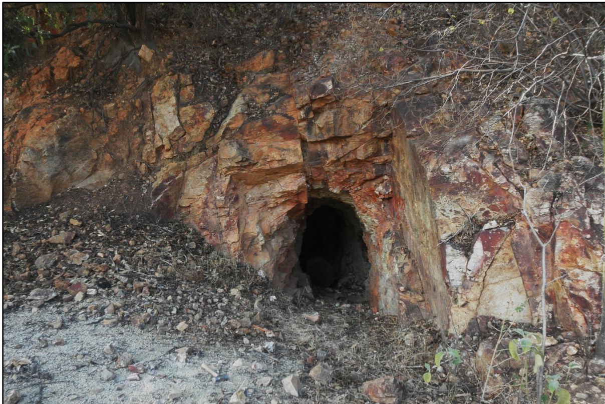
Figure 4. Sampling (channel 0.3 metres) to right of 1.5metre wide adit, silicified breccia, N30°E fracturing filled with quartz and sulphides, El Chon artisanal workings on Diamante 1.

The Property exhibits geological features of epithermal low to intermediate sulphidation Ag-Au (Pb-Zn), high sulphidation Au-Cu, and potential transition to porphyry style Au-Cu.