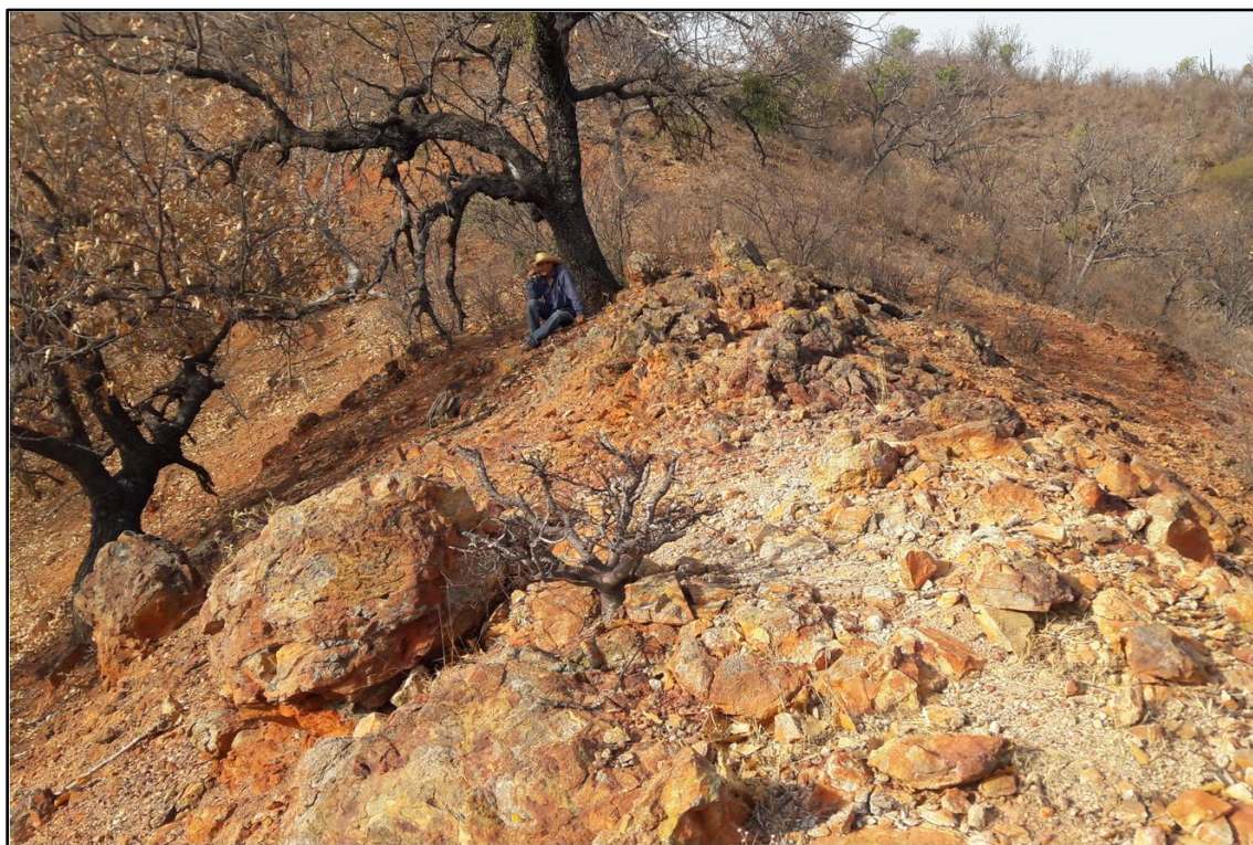
Figure 1. Moderate rolling topography on Diamante 1 showing extensive oxidation, jarosite and argillic alteration at the El Caso showing.