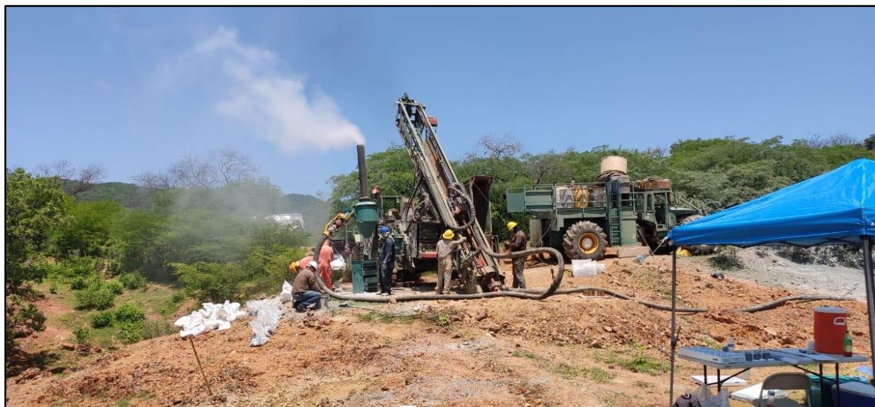
Figure 1. El Mezquite property showing RC rig from Layne de Mexico.