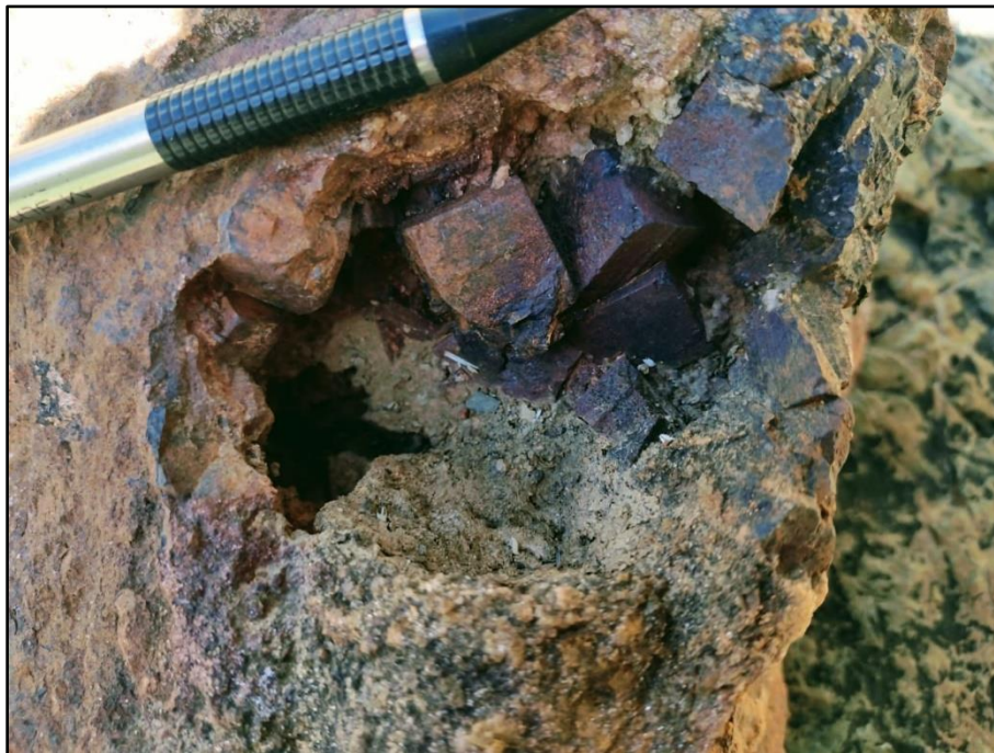
Figure 2. Diamante 2 Concession – Calton Target - Polymetallic sulphide pocket.

Figure 2 illustrates partially oxidized and tarnished sulphide in mineralized open-space filling pocket selected during the 2022 geological mapping at the Calton drill target located in the southwest Diamante 2 concession.