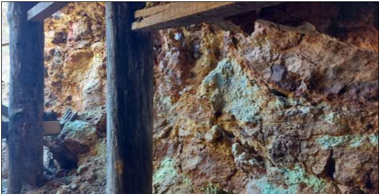
Figure 1. Intense wallrock alteration and primary sulphide to secondary oxide mineralization exposed at the entry to workings at the Pillado drill target.

The drill-ready Diamante gold-silver (Au-Ag) property ("Diamante" or the Property") is located 5 km northwest of the town of Tepoca, and 165 km southeast of the capital city of Hermosillo, eastern Sonora, Mexico.