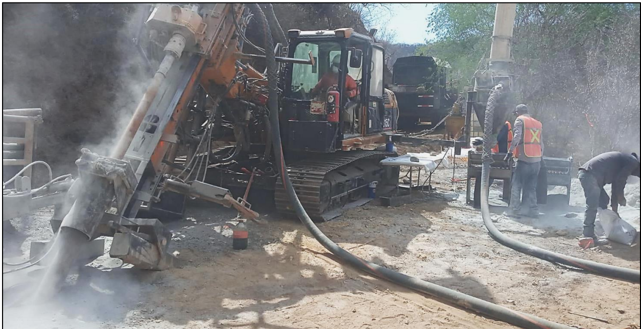
Figure 1. Reverse circulation drill rig collared on pad #40 north of artisanal underground workings at the Pillado drill target, first DDH on the Diamante 1 concession.