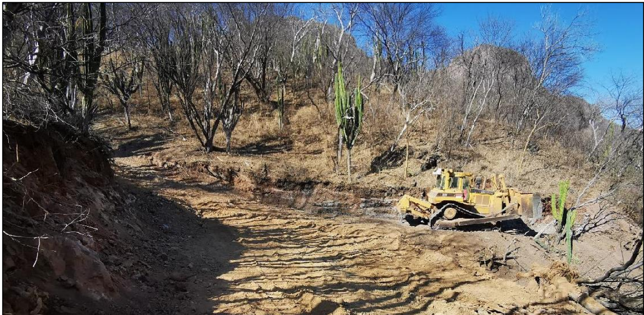
Figure 4. TRAX preparing pad #8 to the north above portal to workings at the La Prieta drill target.

Our recent target mapping program reported assays consistent with historical surface and U/G channel samples reported up to 39.8 g/t Au, 3,460 g/t Ag, 18.2% Pb, 33.5% Zn and 1.47% Cu