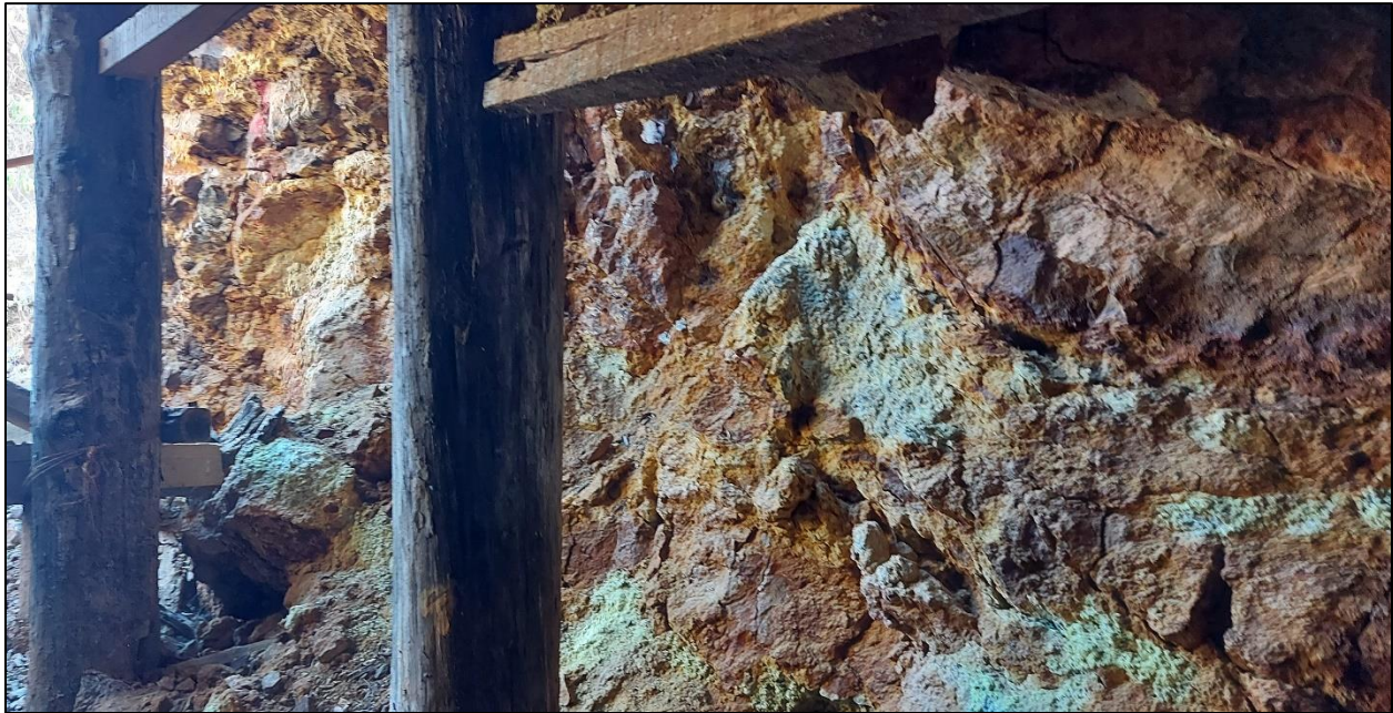
Figure 3. Intense wallrock alteration and primary sulphide to secondary oxide mineralization exposed 20 metres south of pad #40 at the entry to workings at the Pillado drill target.

Specifically, geochemical results from surface and underground sampling of eight target areas reported precious metals (Au to 51.5 g/t, Ag to 2,270 g/t), base metals (Pb to 42.3 wt.%, Zn to 22.9 wt.% and Cu to 3.2 wt.%) and pathfinders each exhibited weak to highly anomalous values commonly with high Ag;Au and low to high Pb:Zn. Elevated Cu, Cd, Sb, Hg, As and Bi are linked commonly to Pb and/or Zn.