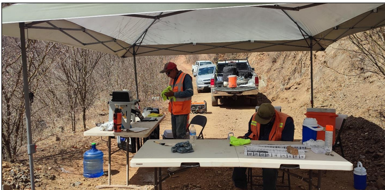
Figure 5. Company geologists utilizing portable X-ray fluorescence (pXRF) analyses on R/C drill chip samples to guide daily drilling activities, hole depth, fan design and undercutting areas of visual mineralization and those indicated by Cu, Pb, Zn, Ag and other pathfinder element data.

Our recent geological mapping programs conducted over multiple targets reported Au values to 51.5 g/t from silicified breccias in the Calton target (see Press Release of April 27, 2022), the highest Au grade yet reported from Diamante, and Ag values >1,000 g/t were recorded from base metal sulphide-bearing veins at Pillado, El Chon and El Cumbro accompanied by high-grade primary and supergene Pb+Zn+Cu up to a combined grade of 50.9 wt.% from grab and channel sampling at surface and within historical trenches and artisanal workings. Importantly, despite the number and quality of known mineralization targets, there is no recorded historical drilling on Diamante to date.