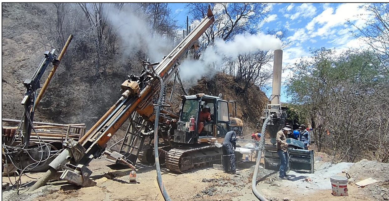
Figure 1. Reverse circulation drill rig collared on pad #40 north of artisanal underground workings at the Pillado drill target, first DDH on the Diamante 1 concession.

"We are pleased to complete successfully our maiden exploration drilling program on two highly prospective areas of Diamante. Our first two drill targets, El Pillado and La Prieta, exhibited multiple intersections of sulphide mineralization, locally with fault controls, comprising polymetallic vein-style occurrences within and adjacent to historical artisanal mining," stated Greg Davison, Silver Spruce Vice-President Exploration and Director.