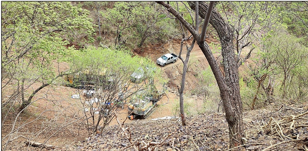
Figure 4. Minera Drilling rig underway on DDH#22-10 to the northwest above portal to workings at the La Prieta drill target.

Samples were screened using pXRF analyses during the on-site logging to provide rapid qualitative data for dynamic decision-making on drill hole planning and depth targeting (Figure 5). Four sample shipments comprising a total of 1,586 samples, including QA/QC insertions, to ALS Global in Hermosillo were delivered on a weekly basis (Table 1). The quantitative drill sample results will be reported in due course.