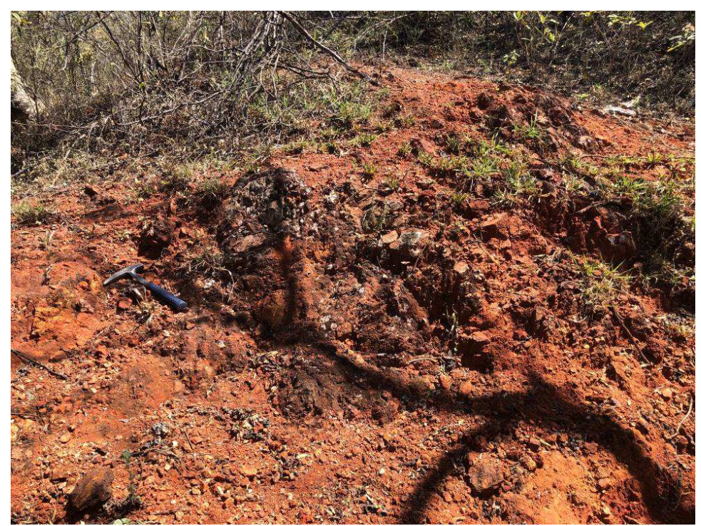
Gossan Outcrop in the gossan zone.