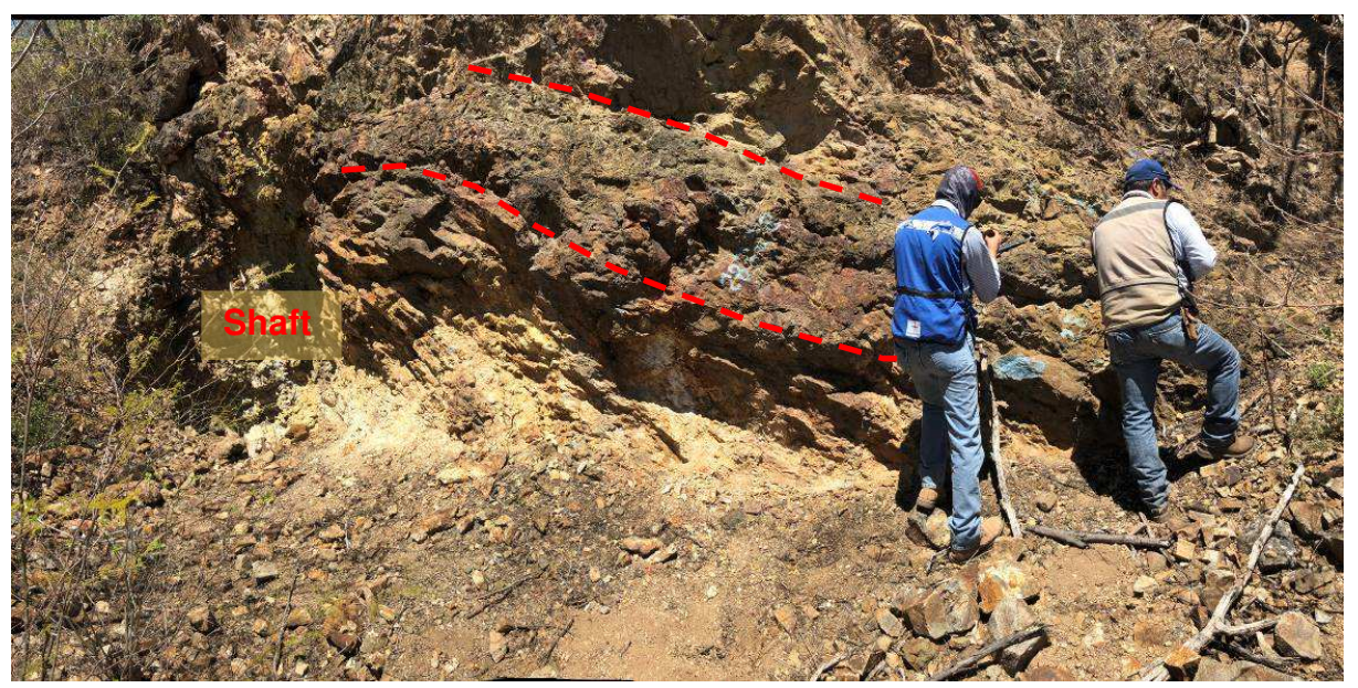
Theodora vein outcrop.