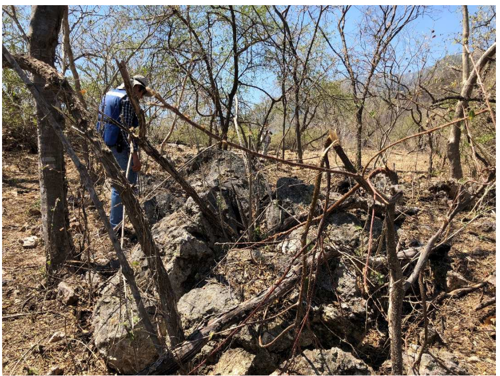
Muro vein outcrop.