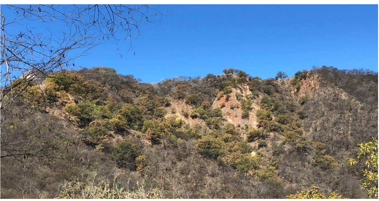
Alteration in the Sierpe area extending to west under volcanic cover, looking west.