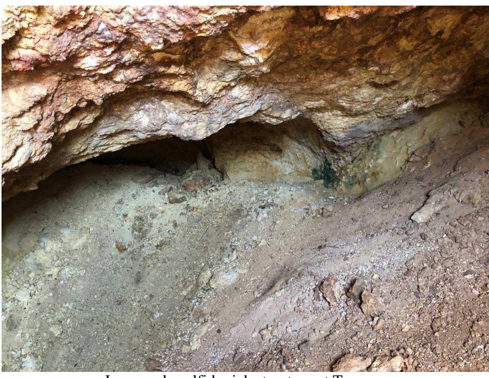
Low angle sulfide rich structure at Terrero.