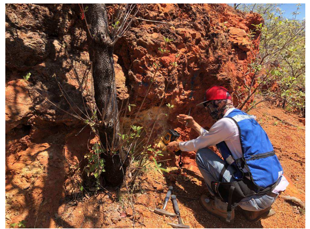
Taking XRF measurement at low angle breccia at Terrero near previous photo.