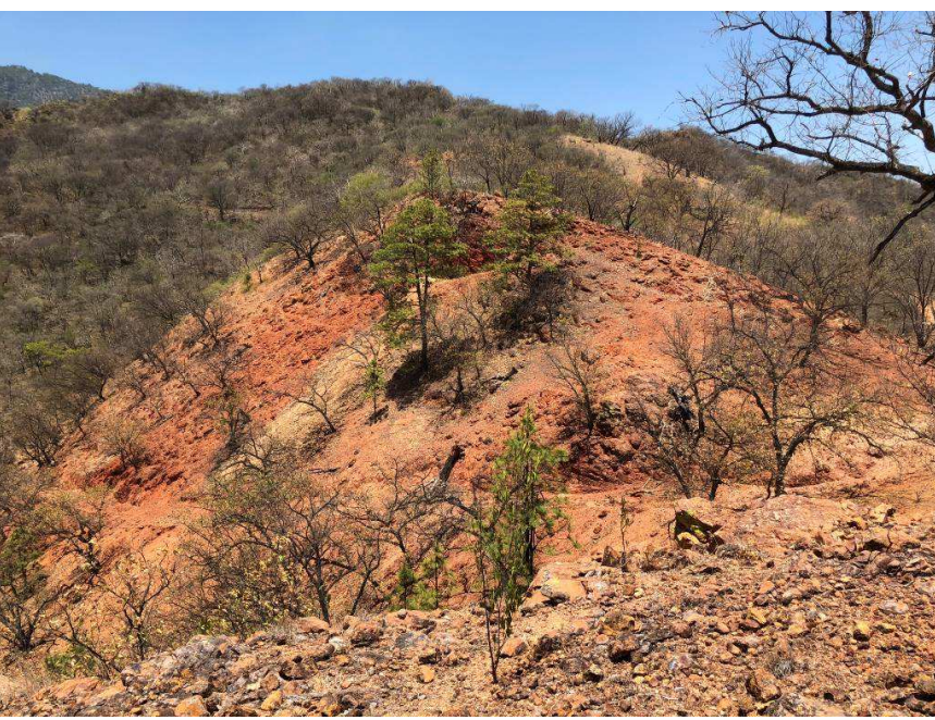
Alteration in the La Perla area. The La Perla workings are behind the tree in the center of the photo.