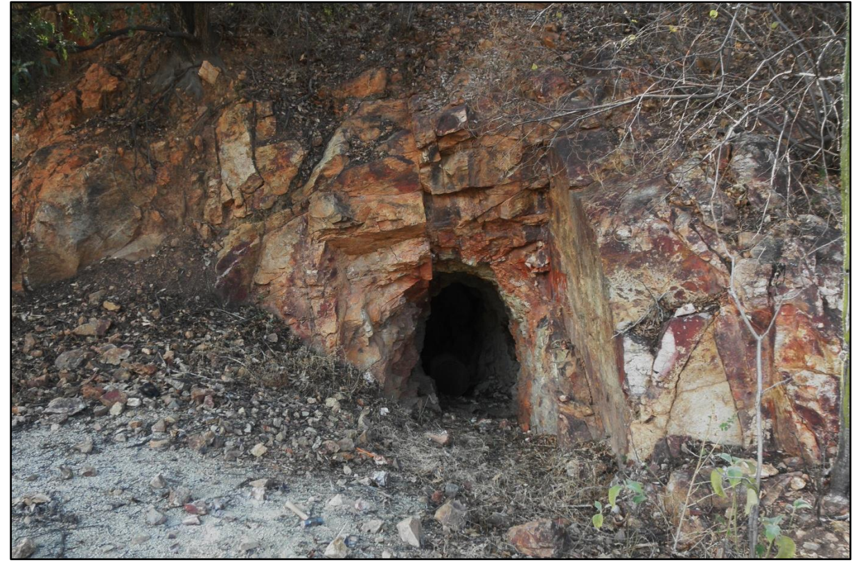
Figure 4. Sampling (channel 0.3 metres) to right of 1.5metre wide adit, silicified breccia, N30°E fracturing filled with quartz and sulphides, El Chon artisanal workings on Diamante 1.

The Property exhibits geological features of epithermal low to intermediate sulphidation Ag-Au (Pb-Zn), high sulphidation Au-Cu, and potential transition to porphyry style Au-Cu.