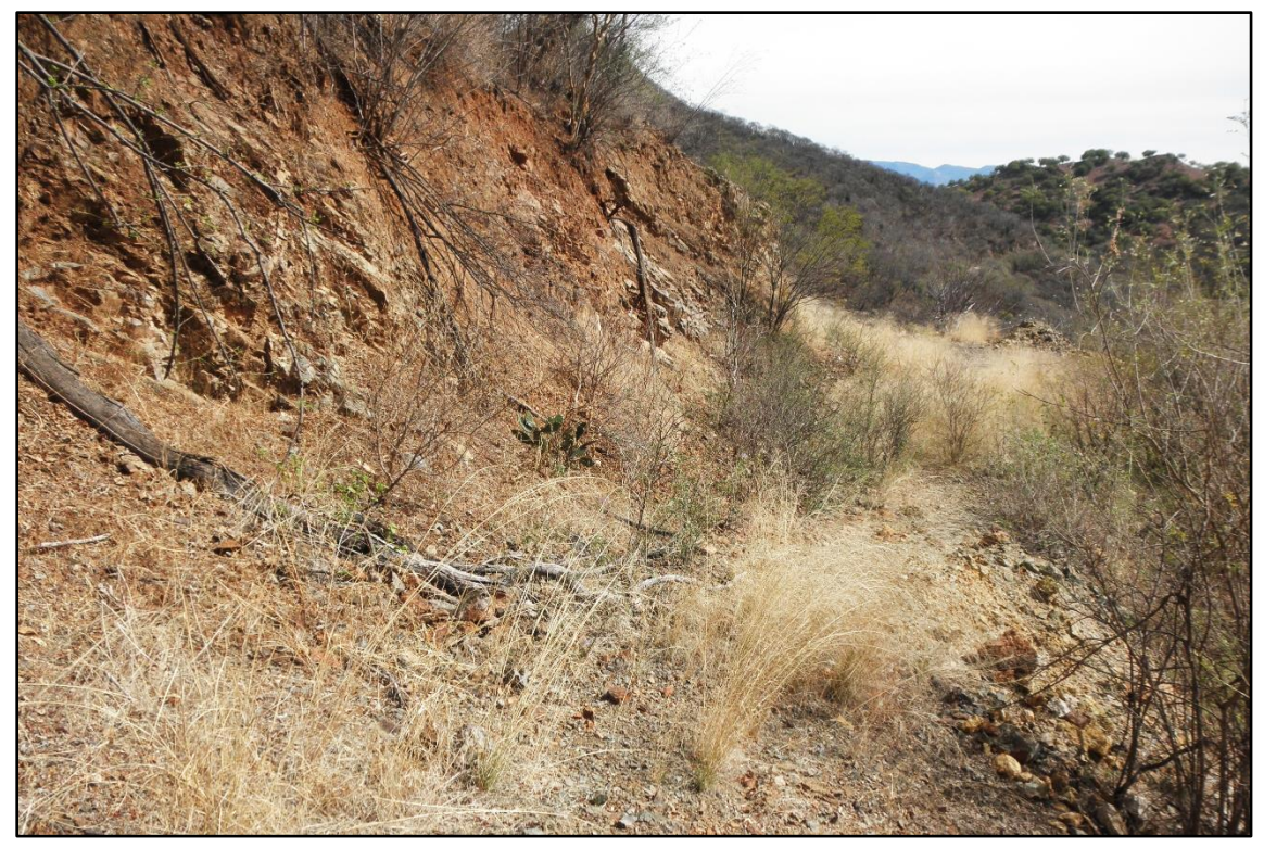
Figure 2. Steep outcrop exposure cut along historical trail on Diamante 1 near La Prieta artisanal mine.

The Eagle Mapping team mobilized from Mexico City with a local flight base from Ciudad Obregón, southern Sonora, Mexico. Our LiDAR survey results are scheduled to be processed and reported shortly.