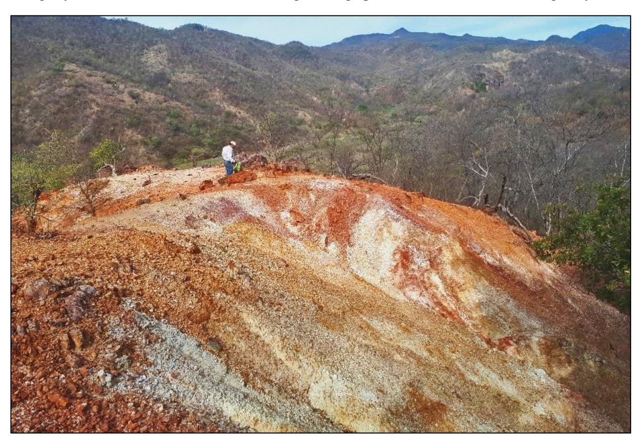
Figure 3. Ridge located >50 metres above the valley floor, showing intense bleaching, oxidation and argillic alteration adjacent to large precious metal and polymetallic anomaly shown in Figures 1 and 2.

The 1,130-hectare Property is easily accessible from Hermosillo to the Tepoca area and heading south from Mexican Highway #16 or west from Highway #117, or from Ciudad Obregón travelling northeast on Hwy. #117 and west to the pueblo of La Quema with vehicles and then pack teams along dry riverbeds, dirt roads and trails. High voltage power lines are located on Highway #16.