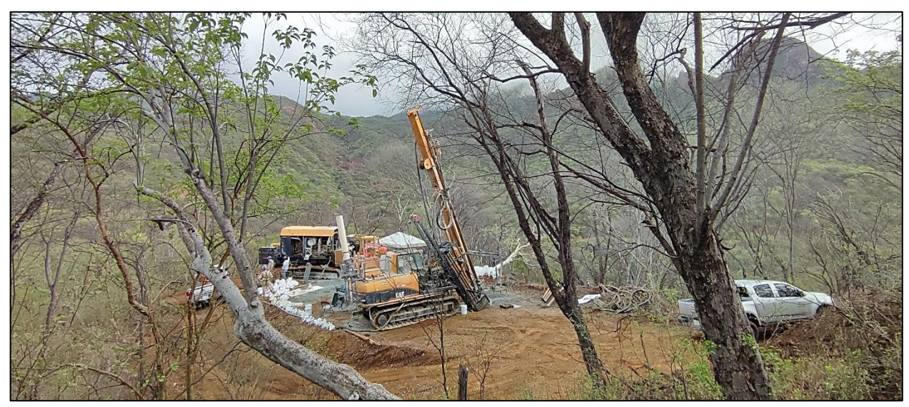
Figure 2. Minera Drilling on DIA22-09 at PAD #46 above and southwest of the historical mine workings at El Pillado target.

"Geological logging and quantitative assays reported from one to six sulphide-bearing zones per hole consistent with pXRF analyses conducted during the drill program. Anomalous values of Pb, Zn, Ag and pathfinders including As, Cd, Cu, Hg and Sb, were confirmed over intersections of up to 7.5 metres (e.g., DIA22-05 24-30 metres and 43.5-51 metres)," Mr. Davison added. "The drilling confirmed the indicated El Pillado mine target, both shallow and at depth, and given the promising metal grades in DIA22-05 (AZ 105°, -45°) remains open to the east. Further ground truthing will be prioritized for structural analysis and potential displacement vectors of projected mineralization peripheral to underground workings. La Prieta drill results will be provided shortly. Other high priority targets at Calton, Aguaje, El Chon, Mezquite Raizudo and several others await ground-based activities. The Companies' land position together at Diamante and other projects in the area have significant exploration potential for a precious and base metals district opportunity proximal to the Santana Mine, a pre-production Au project by Minera Alamos."