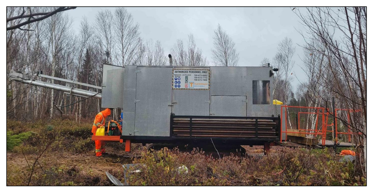
Figure 3. Marilyn property - Trust Drilling rig mobilized on first collar at Tote Brook

Prospecting of the new Marilyn claims identified localized float and outcropping rock samples showing intense silicification with iron carbonate accompanied by multi-phase siliceous veins and breccias, and minor to trace arsenopyrite, pyrite, chalcopyrite and malachite. Gold to 1035ppb, arsenic to >1000ppm and antimony to 346ppm are typical to the coincident precious metals and pathfinder elements of the regional orogenic mineralizing systems.