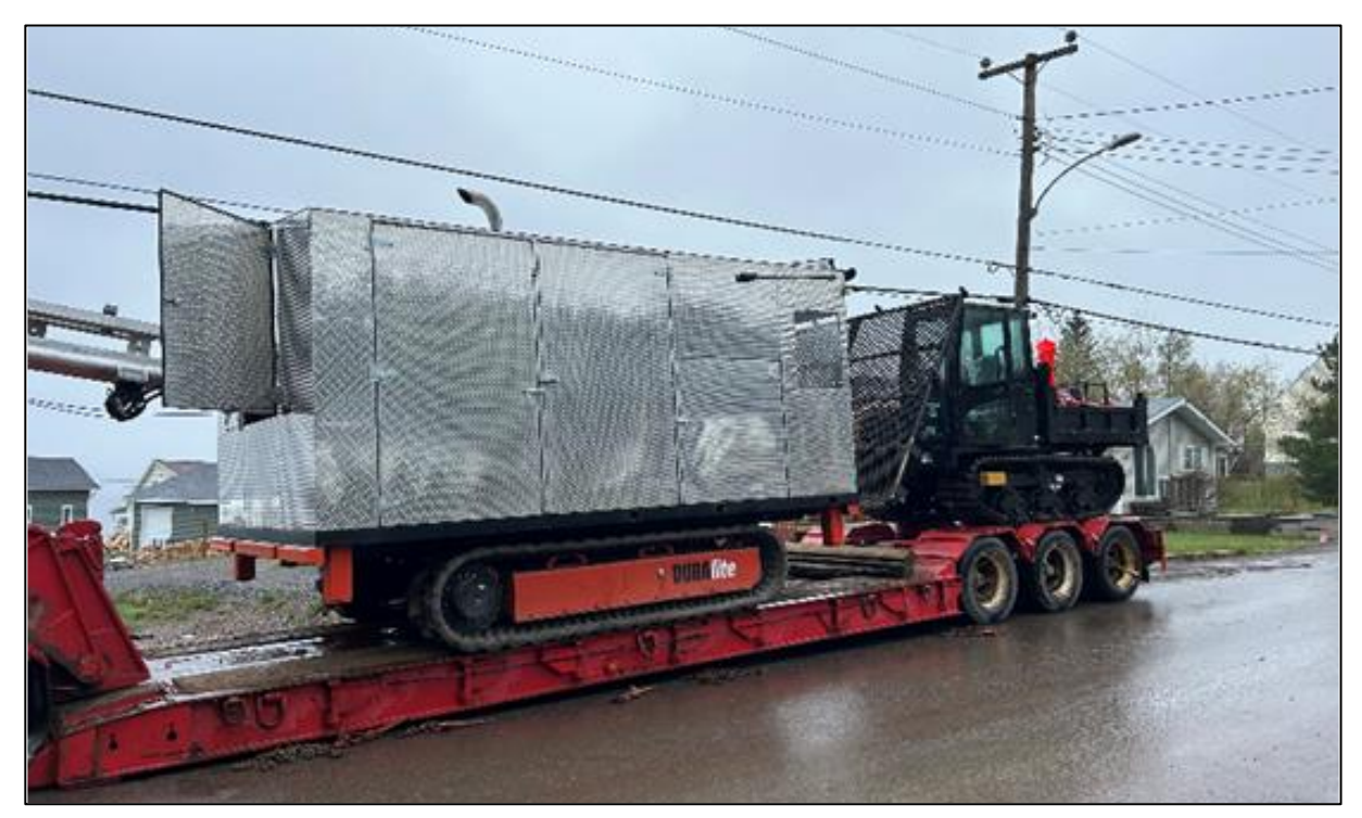
Figure 2. Marilyn property - Trust Drilling rig mobilizing to Tote Brook

Four holes (two scissor sections) directed to the north and south are proposed from the collars TB01 and TB02, respectively, to intersect the down-dip projection of the veins. Trust Drilling will supply a new Duralite Rig(DL1400), moveable with tracks, 5-Ton excavator, Marooka track vehicle and all the necessary supplies associated for NQ core drilling using in-house logistics support (Figures 2 and 3).