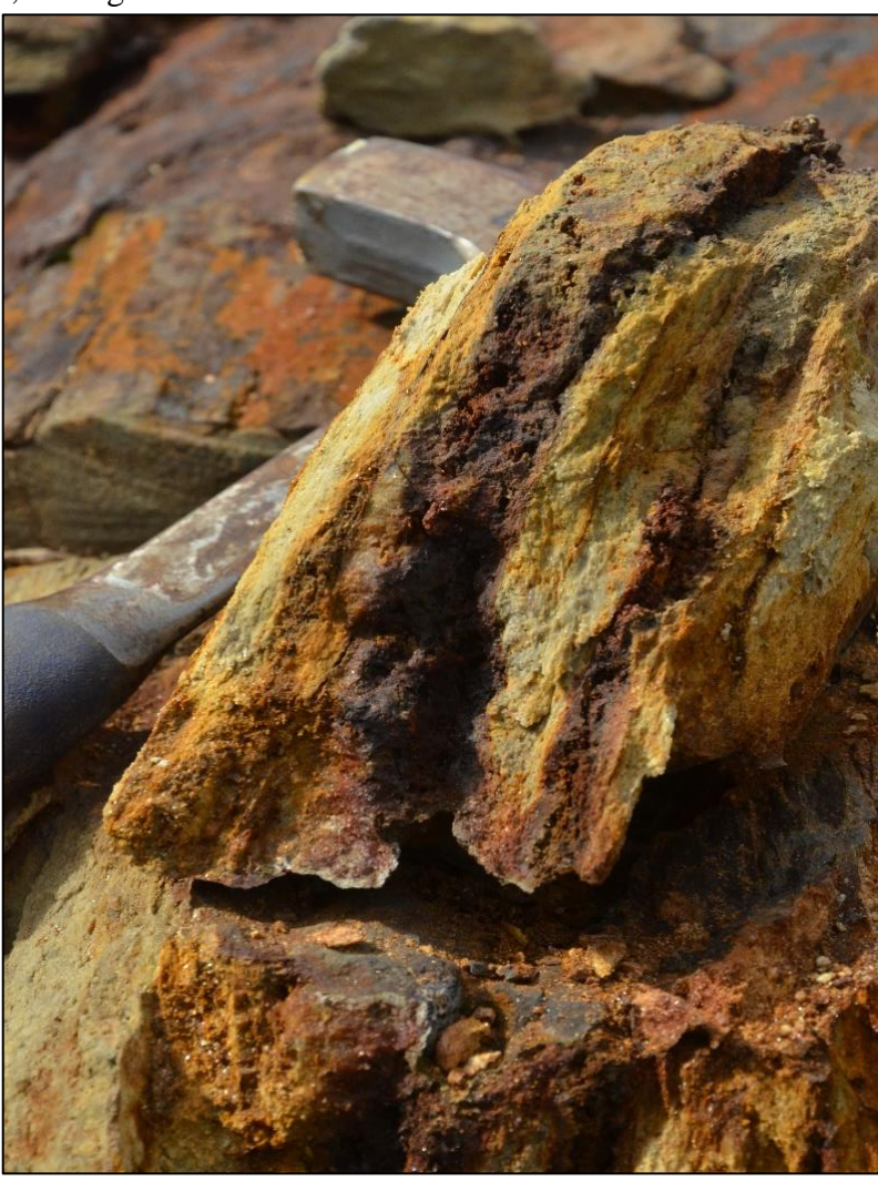
Figure 3. Relf Lake - 30m x 40m gossan zone exposure of moderate to steeply north-dipping zinc (Fesphalerite) mineralization in weathered quartz-sericite-pyrite schist.

The Property now covers 11,236 hectares (480 single cell mineral claims and 5 multi-cell mineral claims with 70 cells) with VMS and Au targets located in east to southeast-striking, tightly folded, subvertical to moderately north-dipping Archean metavolcanic quartz-sericite schists to coarse fragmental units (Figures 3 and 4). These units exhibit steep down-dip to southeast raking or plunging lineations. The Melchett Lake belt contains several occurrences of polymetallic Zn-Pb-Cu-Ag-Au VMS mineralization similar in several respects to deposits exploited at Geco, Mattabi, and Winston Lake, among others.