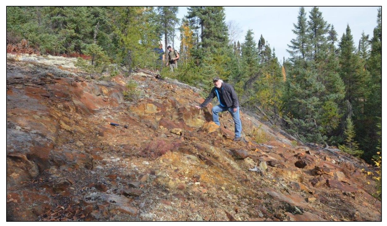
Figure 4. Relf Lake - 30m x 40m gossan zone exposure of moderate to steeply north-dipping and steeply SE-pitching zinc (Fe-rich sphalerite) mineralization in weathered quartz-sericite-pyrite schist.