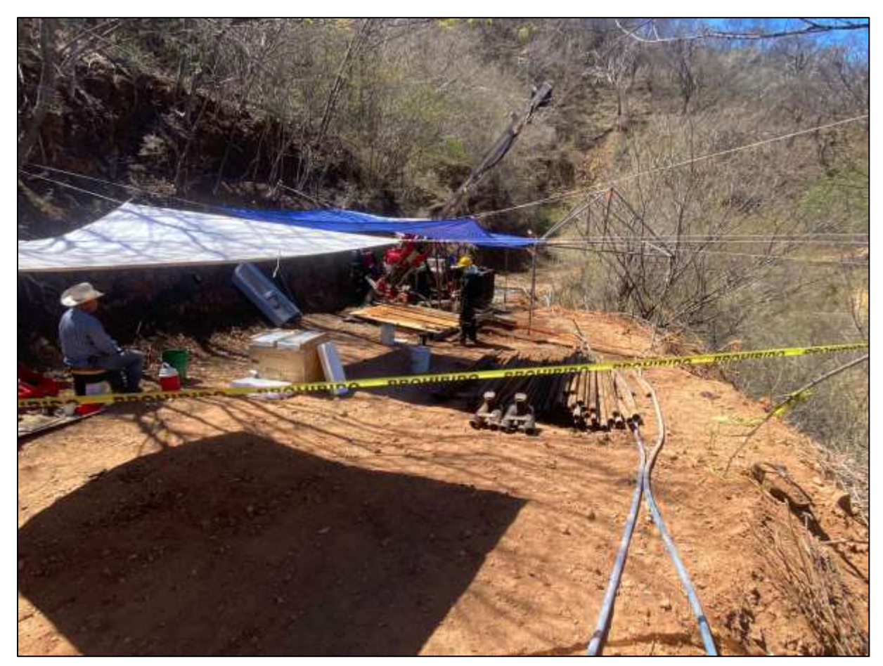
Figure 2. Drilling inclined hole to southeast at El Pillado target northwest of historical mine portal

Colibri (operator) and Silver Spruce completed the first-ever drill program on Diamante at the El Pillado and La Prieta targets located on Diamante 1. Results from the 2022 drilling include 2.48 grams per tonne ("g/t") Au and 56.7 g/t Ag over an intersection length of 9.0 metres ("m") from La Prieta and 0.26 g/t Au and 184.5 g/t Ag over an intersection length of 6.0 m from El Pillado. Drilling at both targets intersected highly anomalous base metals in highlighted drill assay intervals. Through the fall of 2023, Colibri and Silver Spruce completed a program of geological mapping, rock sampling and stream sediment sampling on Diamante resulting in the discovery of two new surface showings (see Colibri press release January 9, 2024). The prioritization of targets and drill plan for Diamante was based on this work combined with comprehensive compilation and interpretation of historical exploration information.