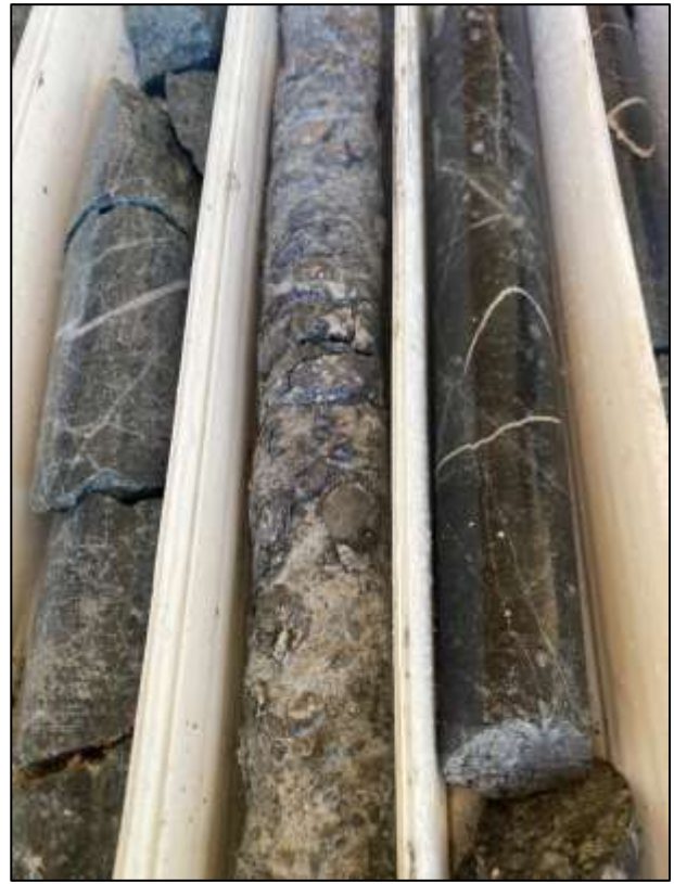
Figure 4. Preliminary examples of high quality drill core from the El Pillado target. Close-up image on the right clearly shows altered volcanics with multiple stages and orientations of veinlets and brecciation with dark blue and green metal sulphides along fractures and fragments within quartz-carbonate matrix.