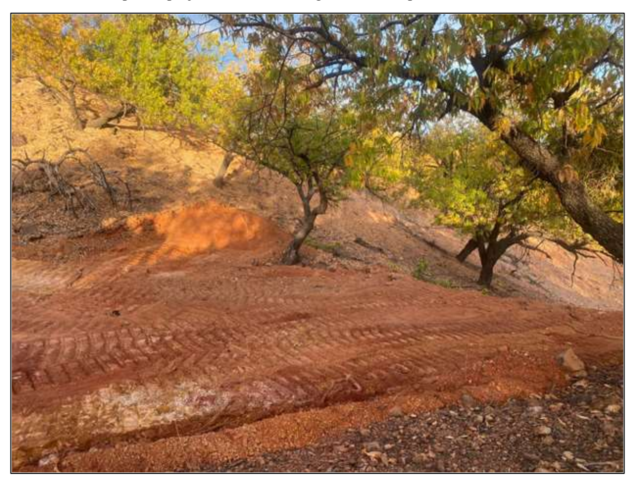
Figure 3. New drill pad ready for rig mobilization on the El Pillado target at Diamante 1.

The Property is located within the west-central portion of the Sierra Madre Occidental Volcanic Complex within the northwest-trending "Sonora Gold Belt" of northern Mexico. Mining and exploration in the surrounding area is very active with adjacent and nearby properties held by Alamos Gold, Argonaut, Agnico Eagle, Evrim, Newmont, Garibaldi, Kootenay Silver and Penoles among others. Diamante is located approximately 12 km northwest of Minera Alamos' Santana Au development project which is nearing commercial production.